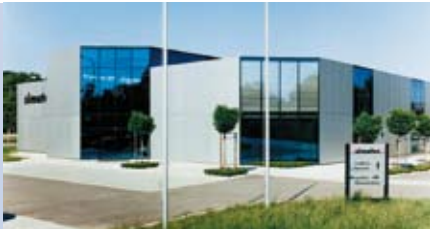
simatec ag, Wangen a. Aare, Switzerland